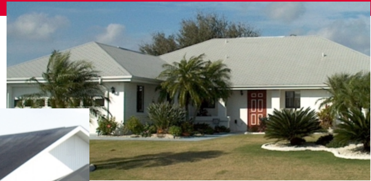
Roof with the Scotchgard™ AR Roofing System installed 1992 and never washed.

See the Scotchgard™ AR System difference for yourself.