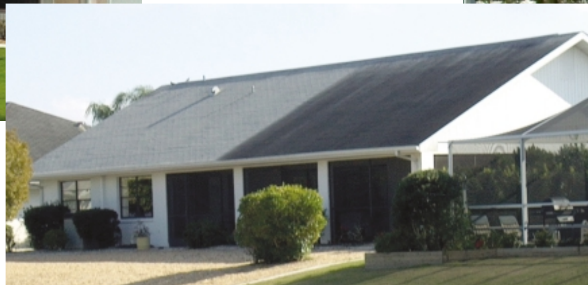
Compare the results on this roof installed in 1996 and never washed. The left side with Scotchgard™ AR Roofing System is like new and algae free. The right sides streaked after just a few years.