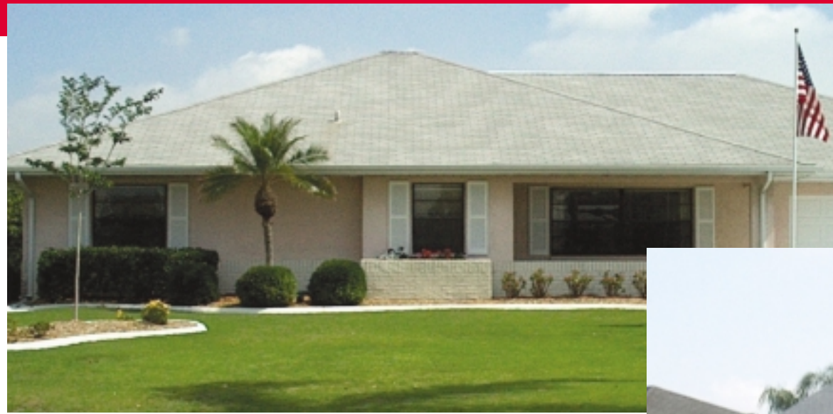
Roof with the Scotchgard™ AR Roofing System installed 1994.

See the Scotchgard™ AR System difference for yourself.